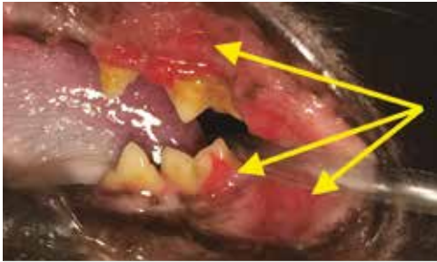
Severe and inappropriate inflammation (arrowed) associated with reaction to plaque.

Here the antibodies bind to bacteria and act to control bacterial numbers, together with white blood cells that also arrive from the blood. This results in gum inflammation.